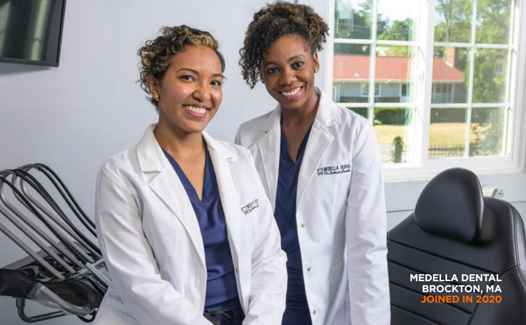
MEDELLA DENTAL BROCKTON, MA JOINED IN 2020